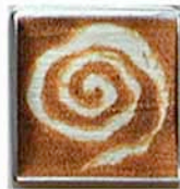
1-1/2" square also available